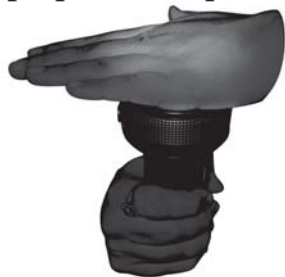
Fig. 4.9 Does torch light pass through your palm?

We can therefore group materials as opaque, transparent and translucent.