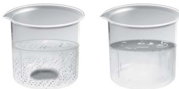
Fig. 4.4 What disappears, what doesn't?

beakers. Fill each one of them about two-thirds with water. Add a small amount (spoonful) of sugar to the first glass, salt to the second and similarly, add small amounts of the other substances into the other glasses. Stir the contents of each of them with a spoon. Wait for a few minutes. Observe what happens to the substances added to water (Fig. 4.4). Note your observations as shown in Table 4.3.