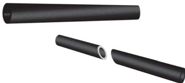
Fig. 4.3 Cutting pieces of materials to see if they have lustre

Do you notice such a shine or lustre in the other materials, cut them anyway as you can? Repeat this in the class with as many materials as possible and make a list of those with and without lustre. Instead of cutting, you can rub the surface of material with sand paper to see if it has lustre.