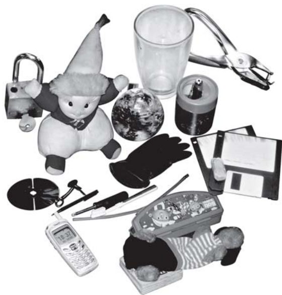
Fig. 4.1 Objects around us

Let us collect as many objects as possible, from around us. Each of us could get some everyday objects from home and we could also collect some objects from the classroom or from outside the school. What will we have in our collection? Chalk, pencil, notebook, rubber, duster, a hammer, nail, soap, spoke of a wheel, bat,