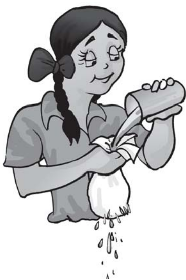
Fig. 4.2 Using a cloth tumbler

Have you ever wondered why a tumbler is not made with a piece of cloth? Recall our experiments with pieces of cloth in Chapter 3 and also keep in mind that we generally use a tumbler to keep a liquid. Therefore, would it not be silly, if we were to make a tumbler out of cloth (Fig 4.2)! What we need for a tumbler is glass, plastics, metal or other such material that will hold water. Similarly, it would not be wise to use paper-like materials for cooking vessels.