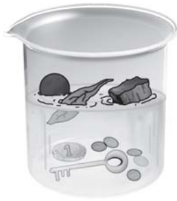
Figure 4.6 Some objects float in water while others sink in it

drops of honey that you let fall into a glass of water. What happens to all of these?