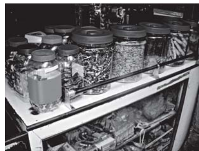
Fig. 4.8 Transparent bottles in a shop

hide behind a glass window? Obviously not, as your friends can see through that and spot you. Can you see through all the materials? Those substances or materials, through which things can be seen, are called transparent (Fig. 4.7). Glass, water, air and some plastics are examples of transparent materials. Shopkeepers usually prefer to keep biscuits, sweets and other eatables in transparent containers of glass or